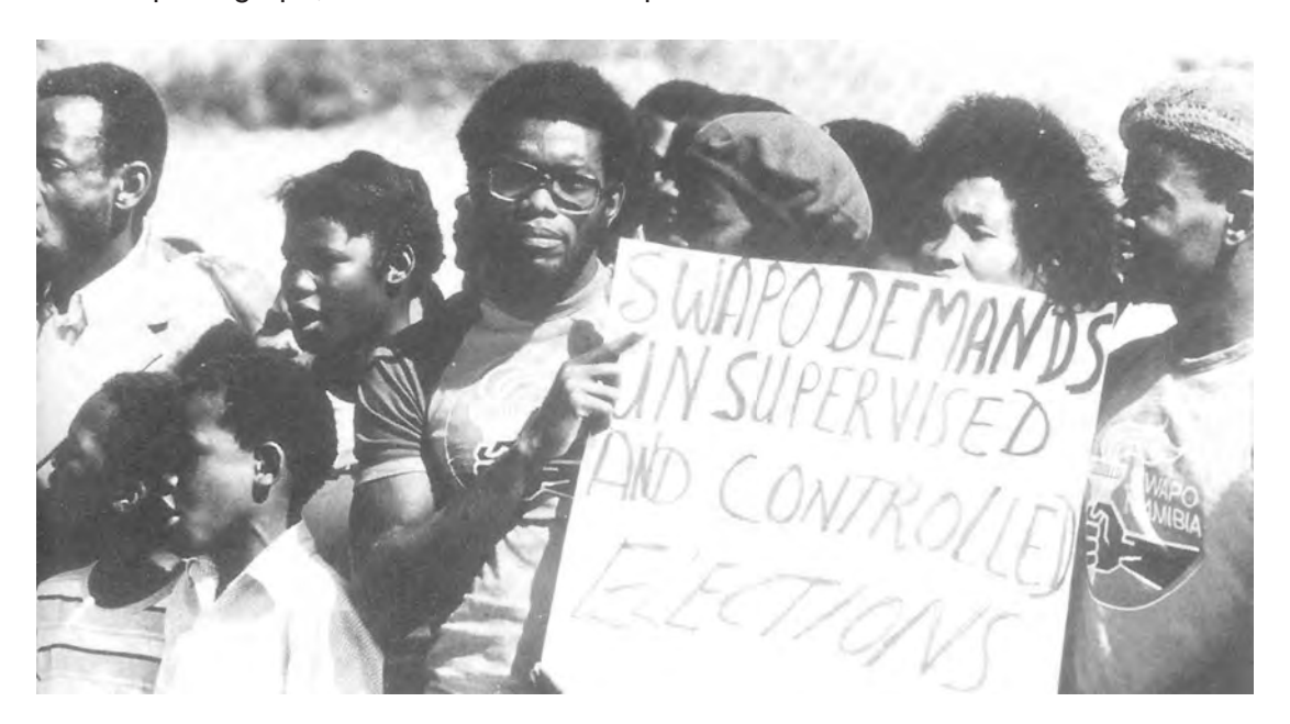
A photograph of a SWAPO protest in 1978.

19 Look at the photograph, and then answer the questions which follow.