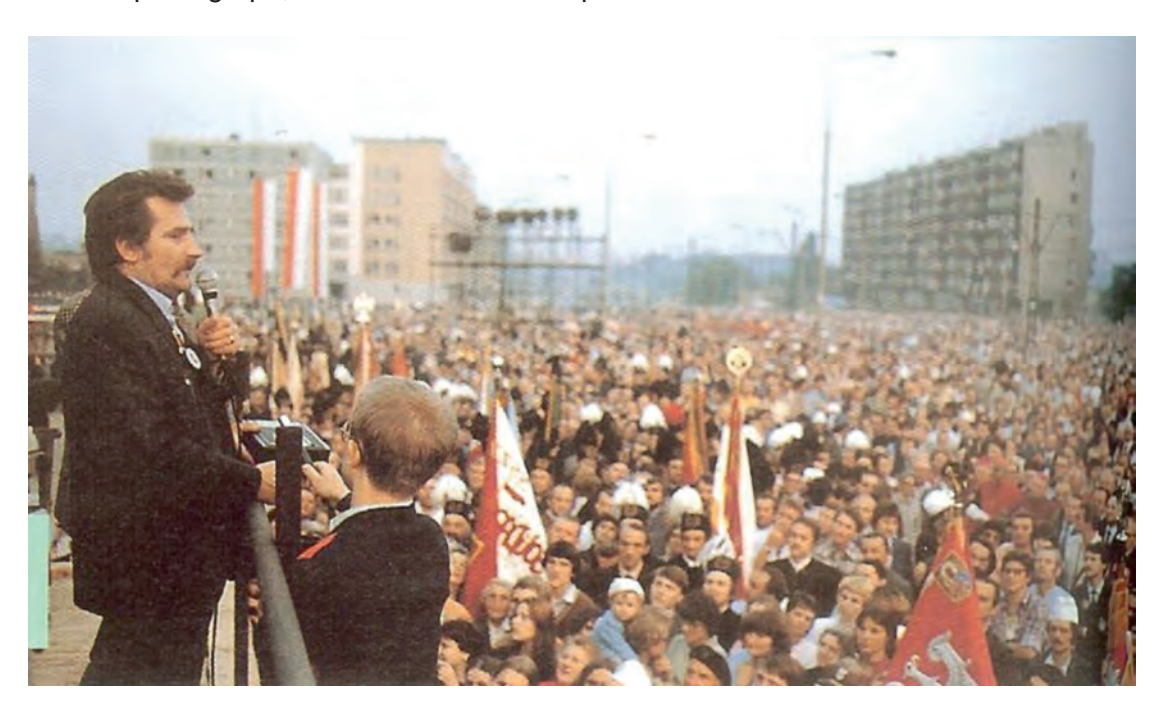
A photograph of Lech Walesa, the 'Solidarity' leader, speaking at Gdansk in 1980.